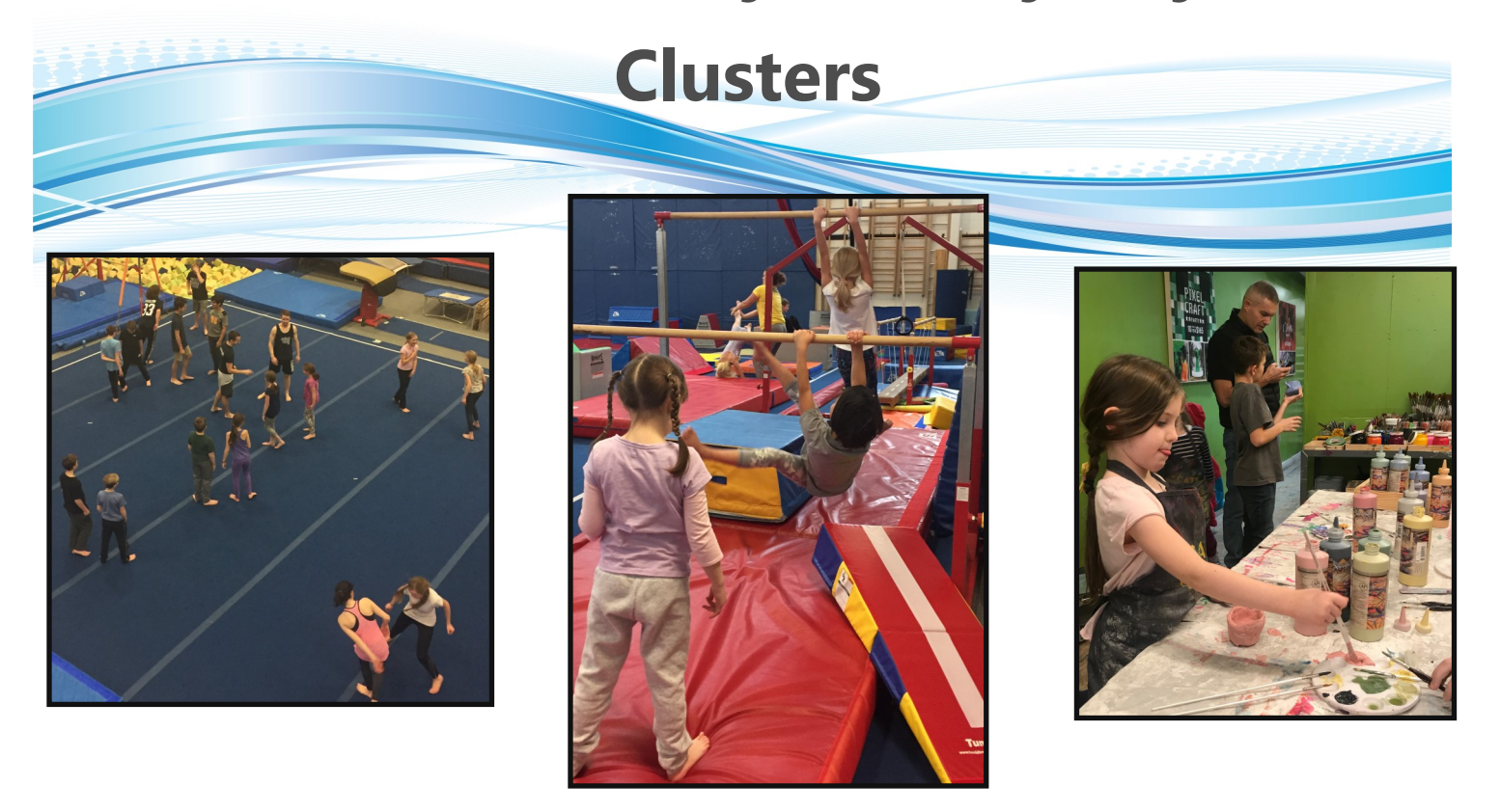
Activity Cluster Success!

Our activity cluster are so much fun! If you didn't sign up for this term you definitely need to look into joining next term.