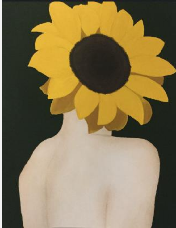
New Growth ~Michaelyn Redgwell