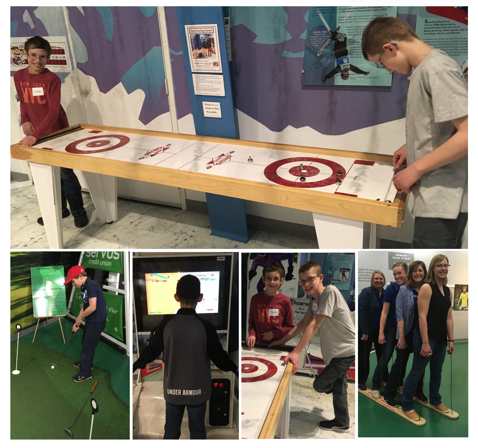
Fun At the Alberta Sports Hall of Fame!

#103,1001-20 Ave | Box 2220 Didsbury, AB T0M 0W0 | 1 877 335 1171 www.northstaracademycanada.org | office@nsaschool.ca